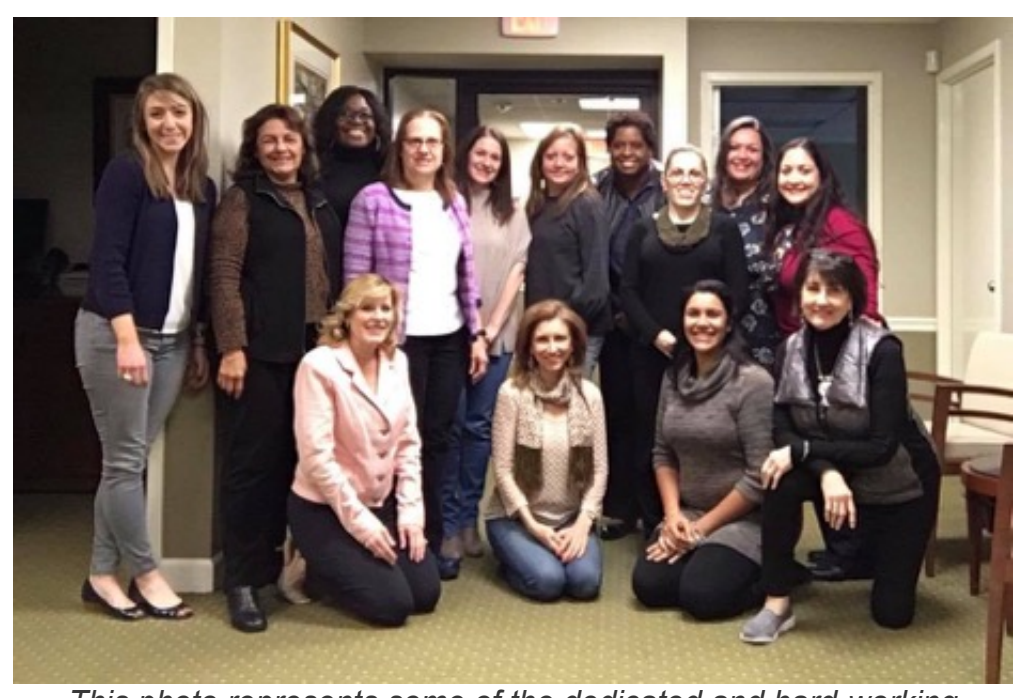
This photo represents some of the dedicated and hard-working women at OWIT that work "behind-the-scenes" in managing our programs & webinars, sponsorships, conferences, our chapter support and much more. Our team rocks!

The Organization of Women in International Trade International (OWIT) is a global association for women in international trade and business. Our 2,000-plus members impact hundreds of millions of dollars in trade and business transactions annually. OWIT's focus is on adding value to our corporate, mid-sized, small business and individual members around the world. (<a href="https://www.owit.org">www.owit.org</a>)