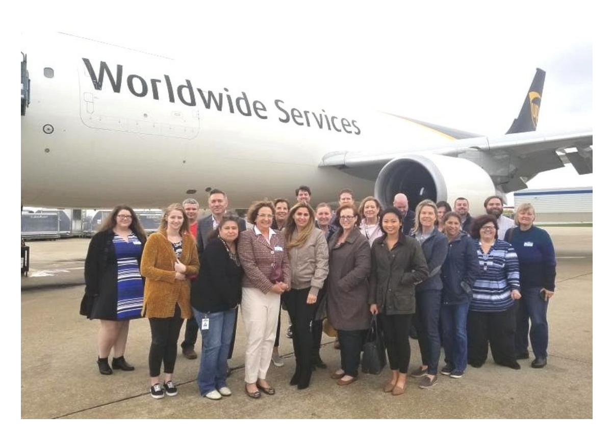
Photo of the team from OWIT Chicago's Signature event on October 4th - The O'Hare Cargo tour.

OWIT DR at the Employability and Women's 2019 Conference