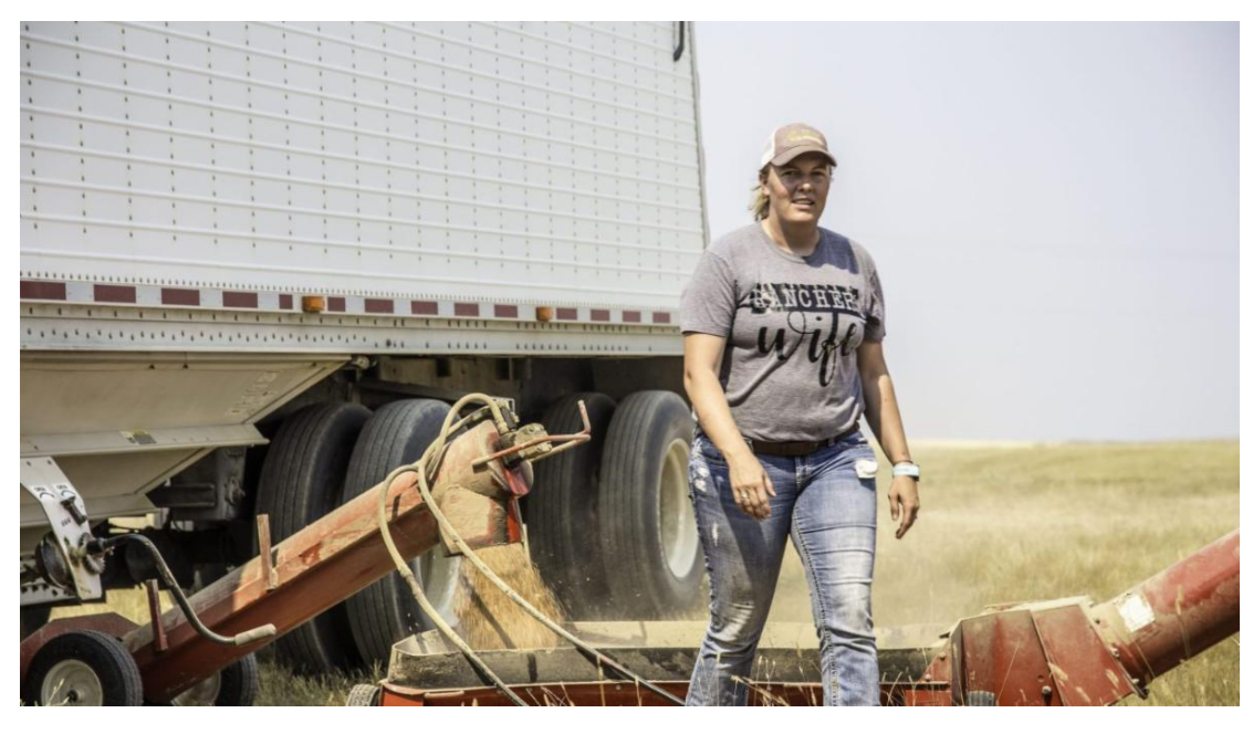
My Economy: Farming and ranching are tough jobs. With restricted access to export markets and the current trade war, farmers' earnings across the country are